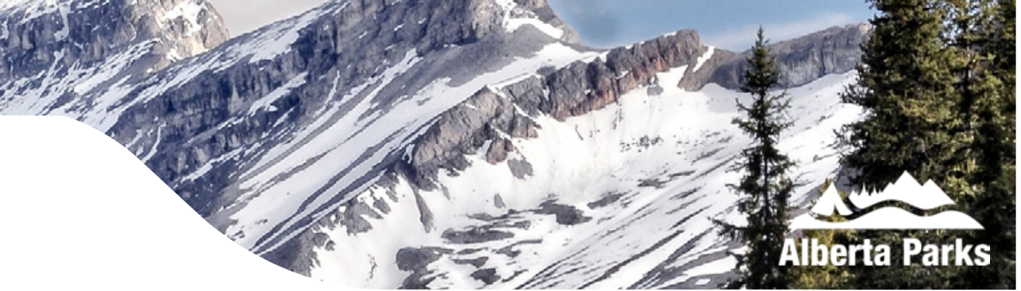
William Watson Lodge, Alberta