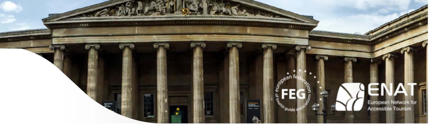
At the British Museum © Efi Kalamboukidou