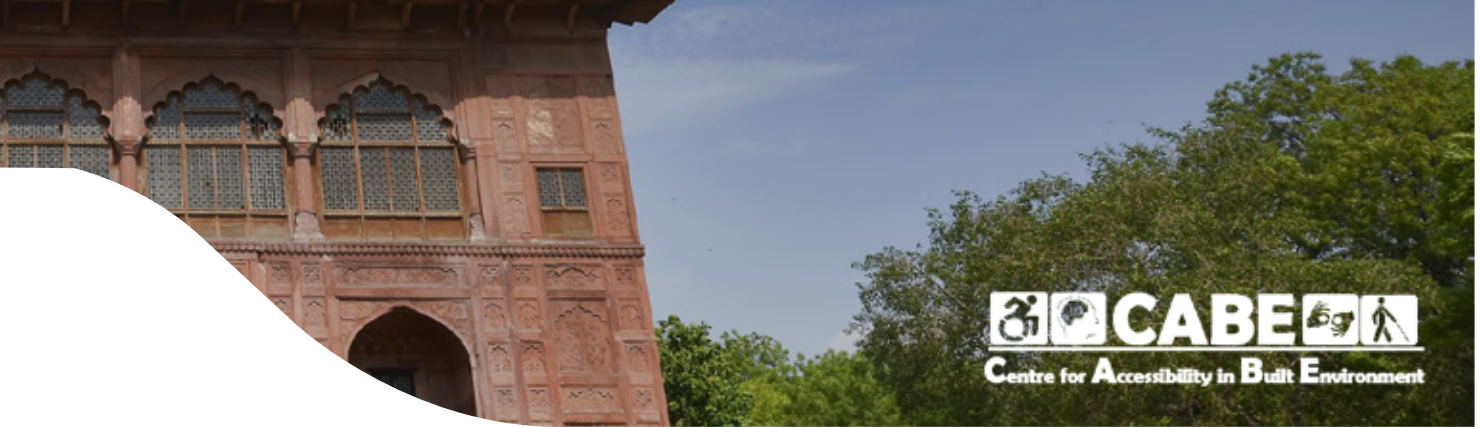
Red Fort, New Delhi

The solutions for each project were designed with regard to the specific requirements of each individual site and included ramps, handrails, accessible toilets and accessible signage. Braille signage was used alongside the text signage, providing information about the sites.